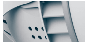
High grade aluminium housing